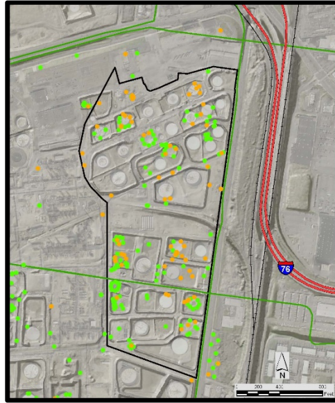
Figure 4. Soil Samples