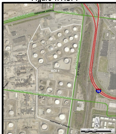
Figure 1. AOI 1