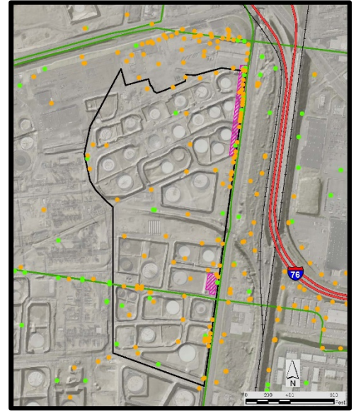
Figure 5. GW Samples

The full AOI 1 RIR has large-scale figures that illustrate the information collected in AOI 1 that are easier to read, as well as the complete data tables that have all laboratory results compared to the Act 2 standards. The full AOI 1 RIR also summarizes how much of the chemicals are present in AOI 1, including the extent of the benzene in groundwater, and the associated monitoring wells.