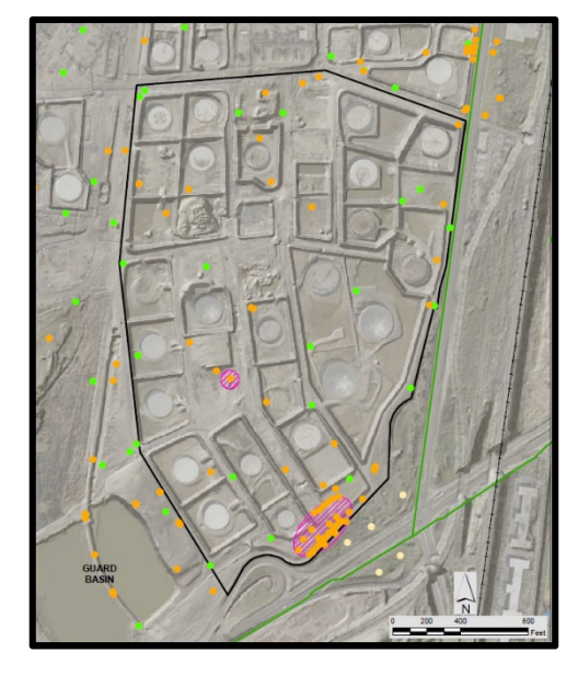
Figure 3. LNAPL Delineation