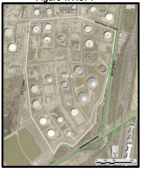
Figure 1. AOI 4