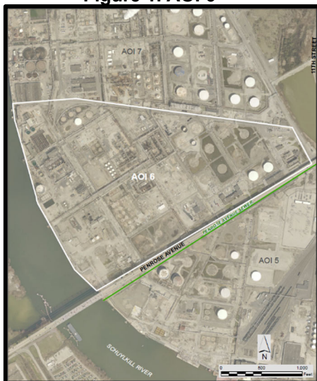
Figure 1. AOI 6