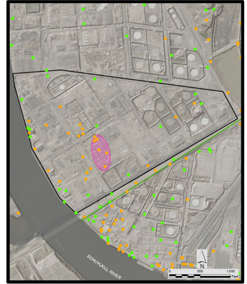
Figure 5. GW Samples

The full AOI 6 RIR has large-scale figures that illustrate the information collected in AOI 6 that are easier to read, as well as the complete data tables that have all laboratory results compared to the Act 2 standards. The full AOI 6 RIR also summarizes how much of the chemicals are present in AOI 6, including the extent of the chemicals in groundwater, and the associated monitoring wells.