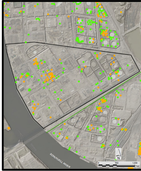
Figure 4. Soil Samples