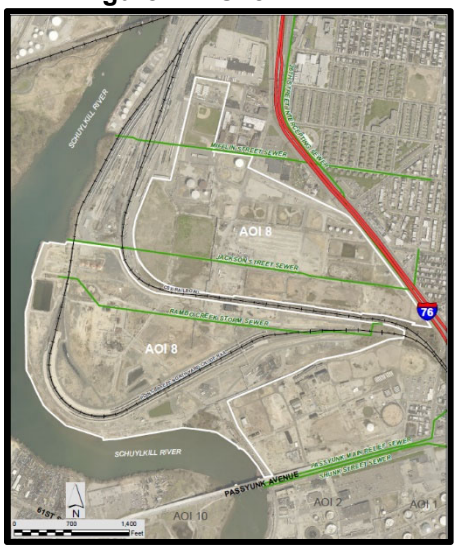
Figure 1. AOI 8