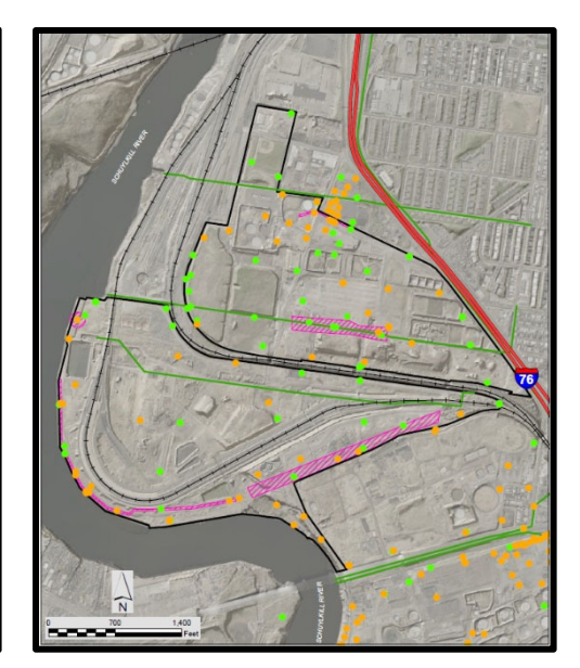
Figure 3. LNAPL Delineation